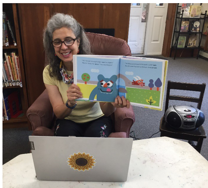
4. Virtual Storytime, spring 2020