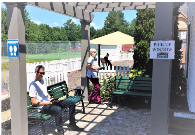
1. Using the Wi-Fi, June 2020