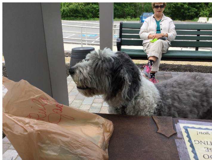
3. Window pick up, June 2020