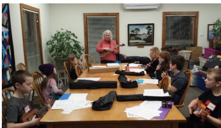
2. Ukulele class, Feb 2020