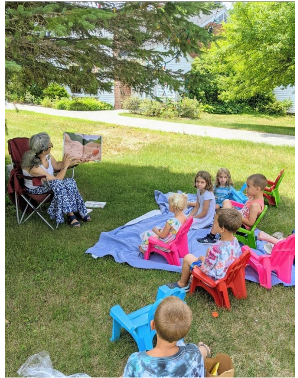
Outside Storytime 2021