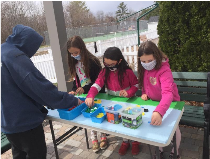
Earth Day Art Project 2021