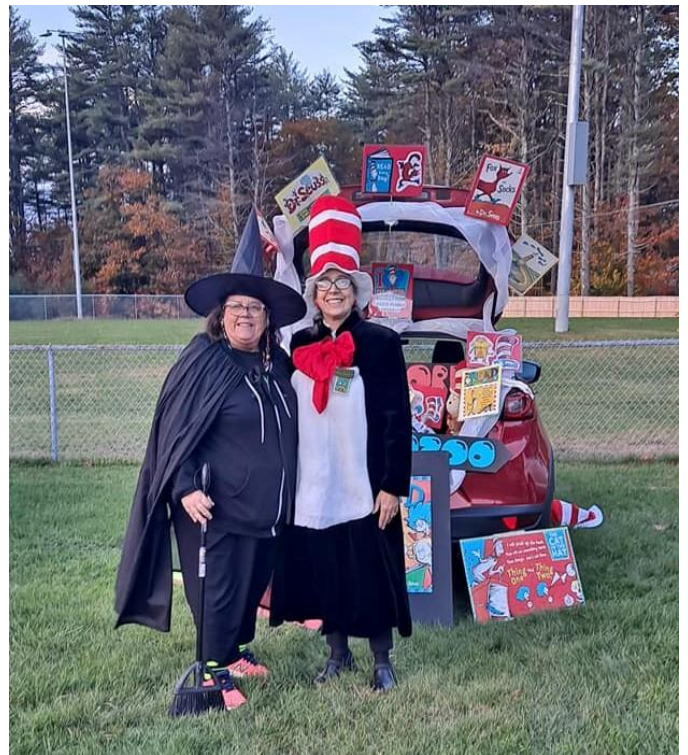
Casco Halloween Trunk or Treat 2021